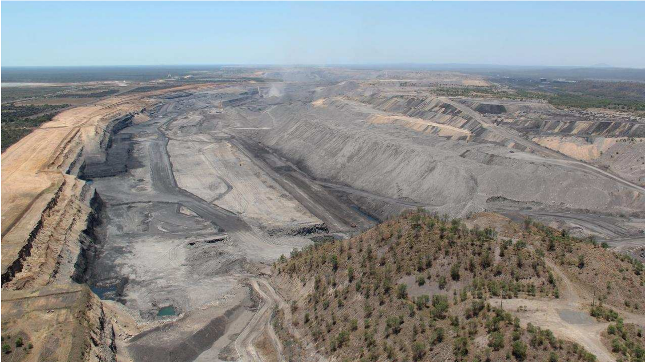
BMA's Saraji Coal Mine near Moranbah

It is alleged no control measures were in place to minimise the serious risks and as a result Mr Houston died.