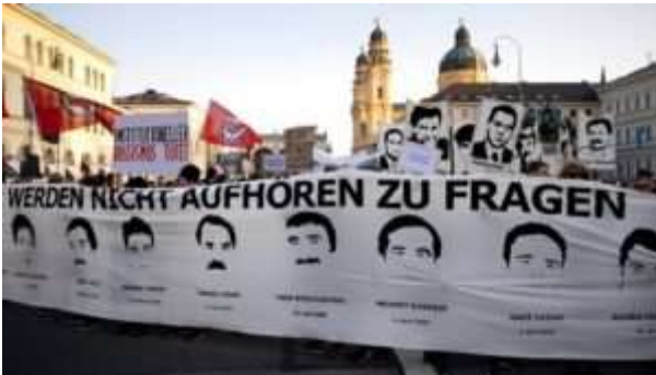
German left slams authorities for covering up crimes of National Socialist Underground