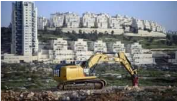
Israel expropriates more land to expand illegal settlement in occupied Palestinian territories