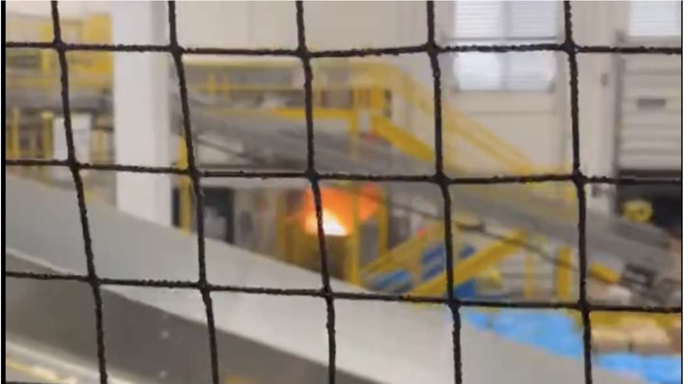
Hundreds of Amazon workers in the US went on strike after a warehouse fire