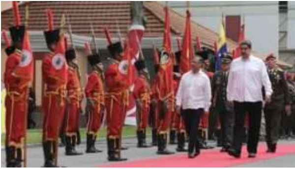
Gustavo Petro and Nicolás Maduro hold historic meeting in Caracas