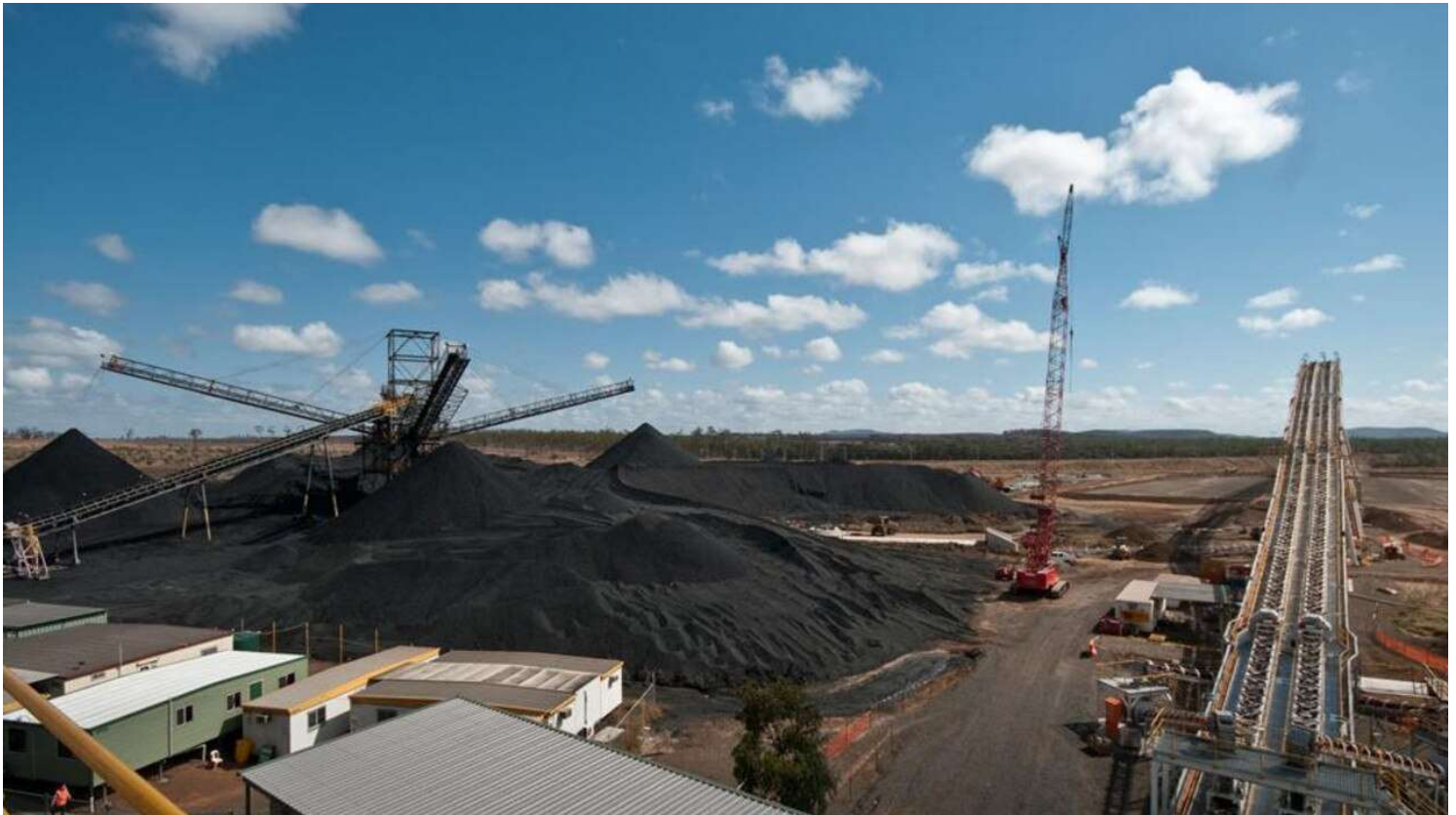
Carborough Downs mine is at Coppabella, west of Mackay.