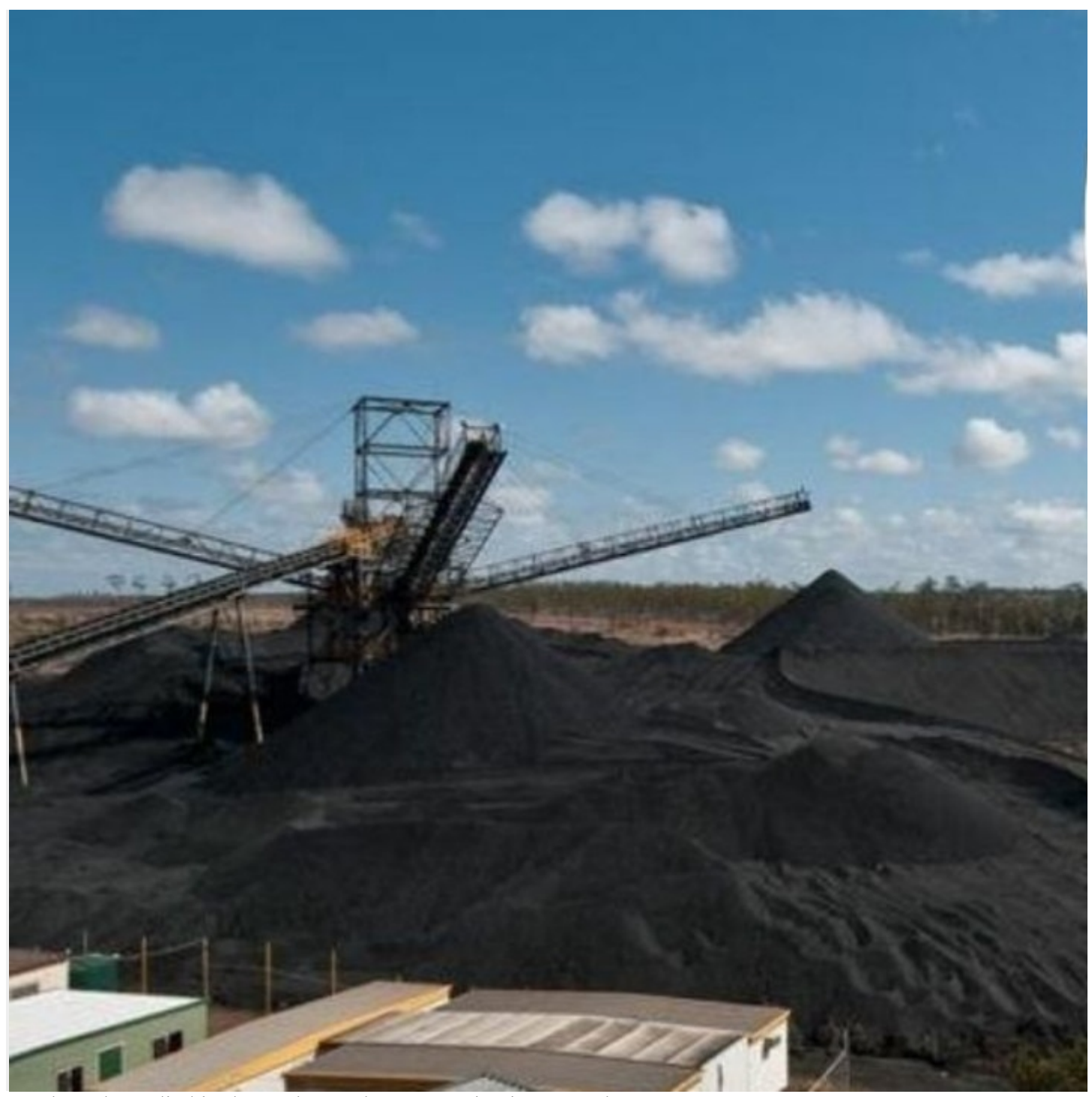
Brad Duxbury died in the Carborough Downs mine in November 2019.