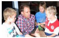
Hayden promotes new book locally