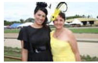
Melbourne Cup day in Mackay