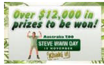
Steve Irwin Day 2010 competition