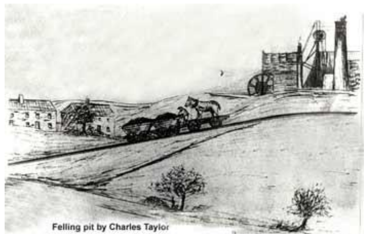
Felling pit

"Felling is situated about a mile and half from Gateshead in the county of Durham. It contains several seams of coal. The present colliery is in the seam called the Lower Main. There are two shafts at the pit. One is called the John pit and is situated on the north side of the Sunderland Road, between felling Hall and the Toll Bar. It was about 200 yards deep. It is used for drawing up coal by means of a fire engine and is furnished with a whim worked by horses, which is useful when the fire engine is unemployed. The other shaft is called the William Pit. It is 350 yards from the John Pit and about 230 yards deep.