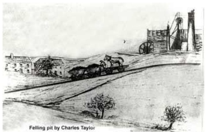
Felling pit

At As the weather was warm, and it was desirable that as much air as possible might pass down the shaft, constables were placed at proper distances to keep off the crowd. Two surgeons were also in attendance in case of accidents. At six o'clock in the morning eight persons descended the William Pit and began to explore the workings. As a current of water had been constantly diverted down this shaft for the space of ten hours, the air was found to be perfectly cool and wholesome. Light was now procured from steel mills. As the explosions had occasioned several falls of large masses of stone from the roof, the removing of