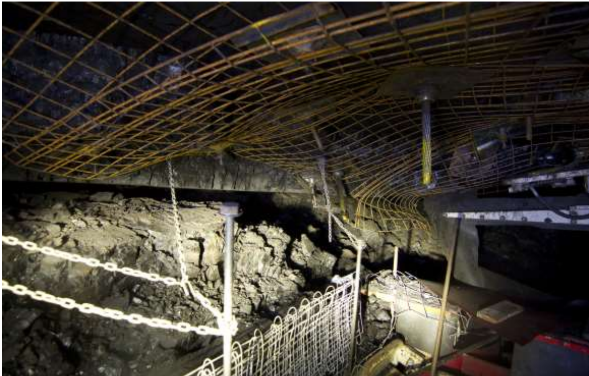
Rib on the left of the bolter miner after the workers were recovered.

Two mine workers died when a major rib/sidewall burst in a longwall development gate road during mining operations. Material from the rib engulfed the two workers who died at the scene. Five other members of the mining crew escaped injury and initiated the mine emergency response system. Investigations into the incident are ongoing.