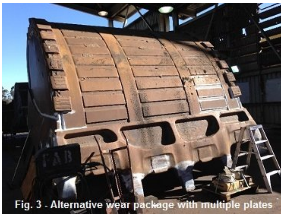
Fig. 3 - Alternative wear package with multiple plates

Authorised by Russell Albury - Chief Inspector of Coal Mines Contact: Theo Kahl, Inspector of Mines, +61